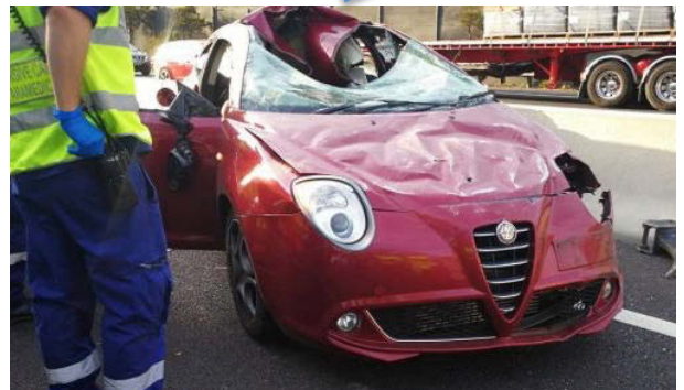
Sydney M5 – January 2018

Already know Load Restraint, but need to know what's coming in the 2018 (3 rd ) Edition?